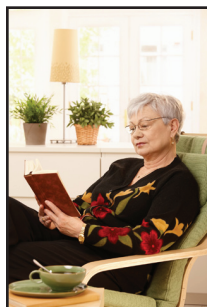
Maximized Near Vision